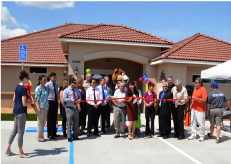
Tulare Community Health Clinic – Woodville

Tulare Community Health Clinic 16686 Road 168 Woodville, CA 93257