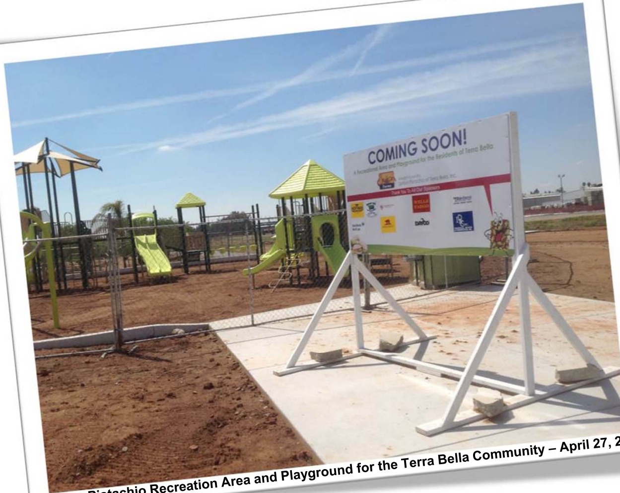
Setton Pistachio Recreation Area and Playground for the Terra Bella Community – April 27, 2014