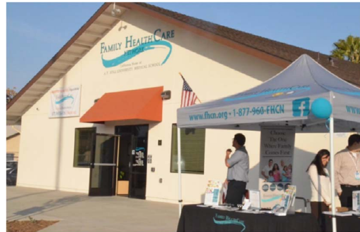
Family Health Care Network – Terra Bella

4,200 Square Foot Facility 6 Exam Rooms 3 Dental Operatories